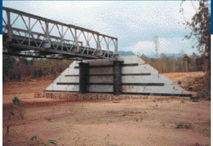
YADANA GAS DEVELOPMENT PROJECT UNION OF MYANMAR

After achieving the construction of wharf and other facilities in the Heinze river, GEOCEAN was awarded another challenging project for the Yadana gas project. As a subcontractor to SPIE CAPAG, GEOCEAN was in charge of the Engineering, Procurement and Construction of 11 bridges along the 60 km surveillance track of the gas pipeline.